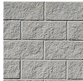
Split Face Stone